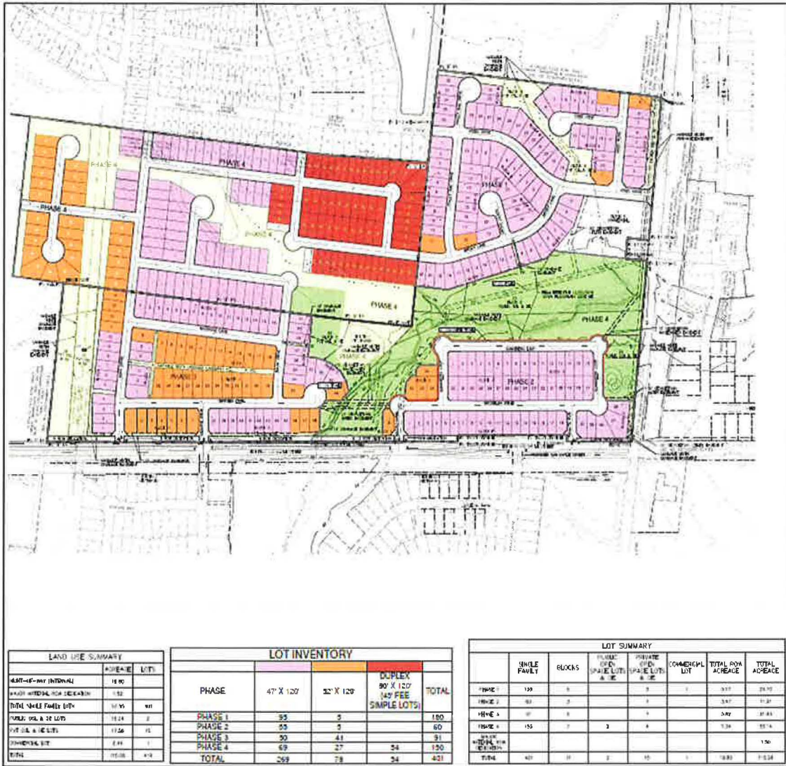
EXHIBIT C – LOT TYPE CLASSIFICATION MAP

RECORDERS MEMORANDUM All or parts of the text on this page was not clearly legible for satisfactory recording